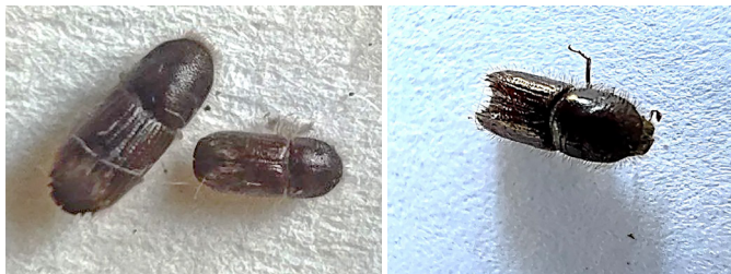
Figure 6. Entomocomplex of spruce stands

bark beetle Ips typographus L., spruce wood engraver Pityogenes chalcographus L., synanthropic species Palorus depressus Fabricius, and entomophagous Thanasimus formicarius . Among them, the largest number of individuals was the European spruce bark beetle. During the entire period of observations of the traps, the capture of an adult European spruce bark beetle in the amount of 10-15 individuals per trap and synanthropic species Palorus depressus was recorded singly. Some species of predatory entomophagous, in particular ant beetle Thanasimus formicarius L., fell into the traps, and one of the traps contained the tanner beetle Prionus coriarius L., but their number was small and did not exceed one individual per trap during the ten-day catch period (Fig. 6).