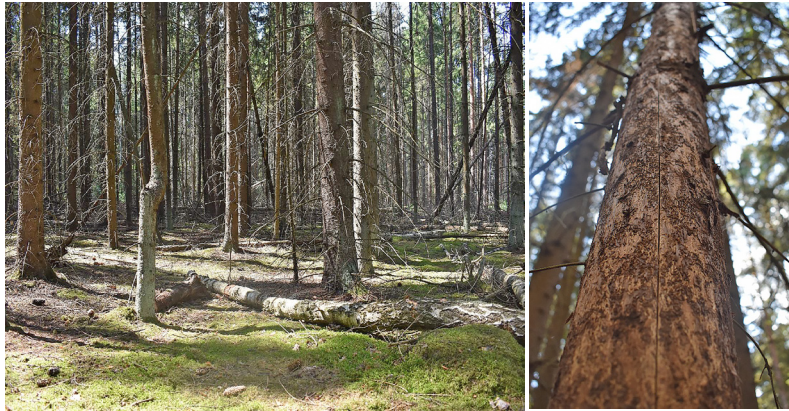
Figure 4. Plantation under study (drying focus)

uniform nature of weakening and allows identifying a number of factors that cause their weakening (Table 2).