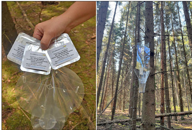
Figure 1. Pheromone trap “Barrier” and a dispenser with artificially synthesized pheromone of Ips typographus

number of emergence holes) and the density of the settlement.