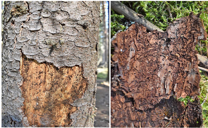
Figure 7. Production of stem pests

younger generation or the production of stem pests of which averaged 34 holes per 1 dm 2 (Fig. 7). Despite the low density of the settlement, Pityogenes chalcographus has the ability to attack almost healthy trees and forms continuous mass populations in the surveyed plantings together with the European spruce bark beetle.