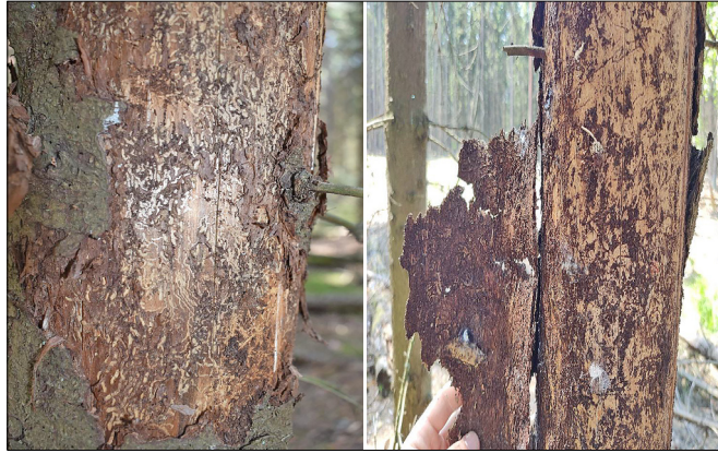
Figure 2. Bark beetle passages and emergence holes